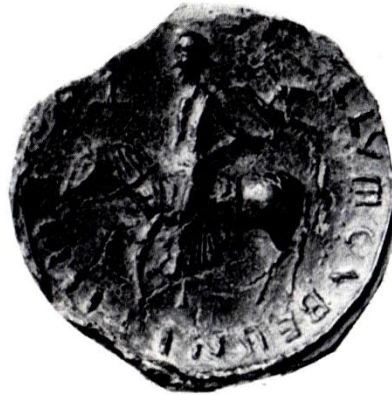
c. 1183. Gilbert Scototh. 2 in. A.727