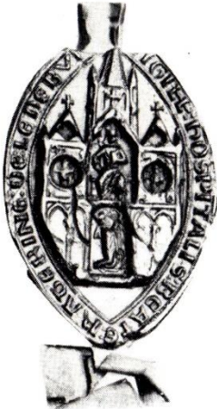
13th cent. St. Katherine's Hospital, Ledbury. 2\frac{3}{8} \times 1\frac{3}{8} in. A.1167