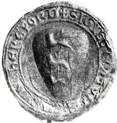
c. 1227. Hereford city. 2\frac{1}{2} in. A.3218