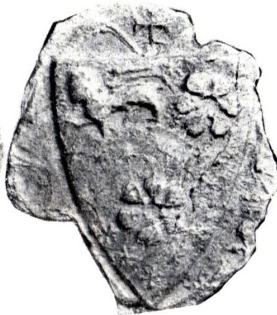
c. 1215. Gilebert de Turbeville. 2 in. (obverse). A.2301