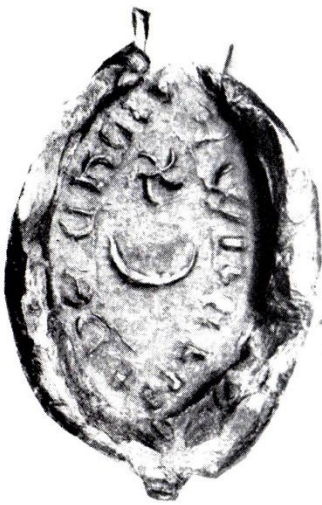
c. 1260. William de Solle. 1\frac{1}{2} \times 1\frac{1}{4} in. A.1668