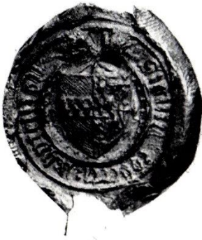
1391. Robert de Whynton. \frac{7}{8} in. A.2692