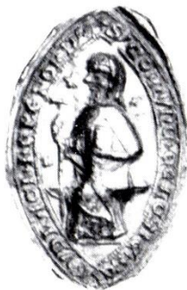
1354. St. Guthlac's, Hereford. 2\frac{1}{4} \times 1\frac{1}{4} in. A.735