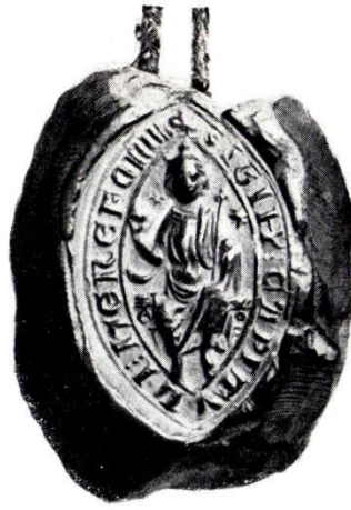
1330. Hereford Cathedral. Counter seal. 2 \times 1\frac{1}{8} in. A.2089