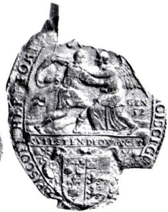
1632. Francis Godwin, bp. of Hereford. 3 \times 2\frac{1}{4} in. A.3535