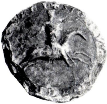
c. 1235. Walter de Laci. 2\frac{1}{4} in. (obverse). A.482