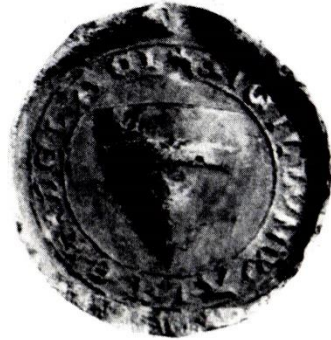
c. 1235. Walter de Laci. 1\frac{3}{4} in. (reverse). A.482