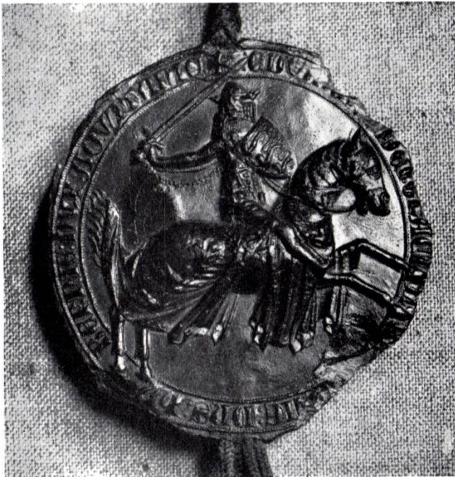
1327. Edward III. Second seal. 4½ in. A.1327