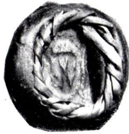
1439. Hugh Carew. 1 \times \frac{3}{8} in. A.2488