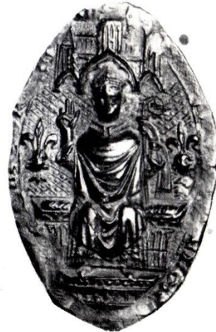
1320. Adam de Orleton, bp. of Hereford. 3\frac{1}{2} \times 2 in. A.1320