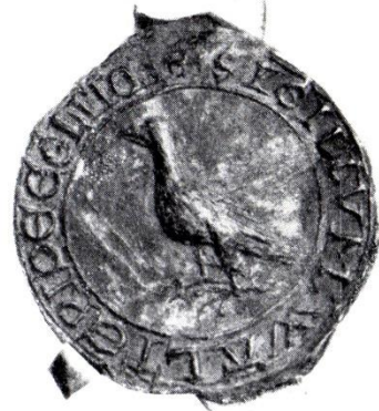
1213-5. Walter de Eglinton. 1\frac{1}{8} in. A.1698