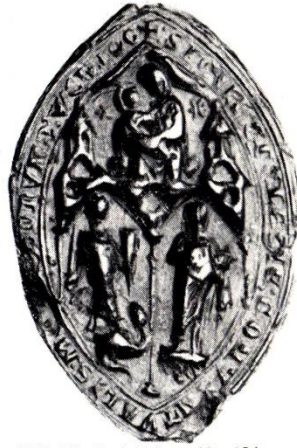
1343. Wenlock Priory. 2\frac{3}{4} \times 1\frac{1}{4} in. A.747