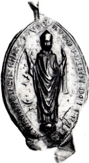
1219-34. Hugh Foliott, bp. of Hereford. 3 \times 1\frac{3}{4} in. A.1165