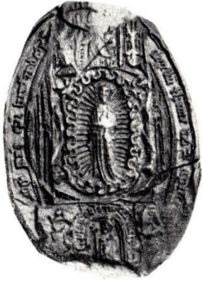
1445. Thomas Spofford, bp. of Hereford 2\frac{3}{4} \times 1\frac{1}{4} in. A.3185.