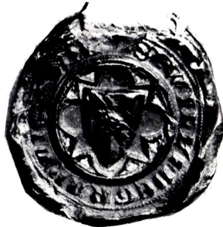
1309. Sir William de Grandison. 1\frac{1}{4} in. A.4113