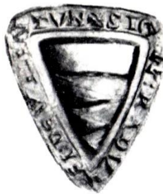
c. 1220. Ralph de Wilintun. 1\frac{1}{2} \times 1\frac{3}{8} in. A.1166