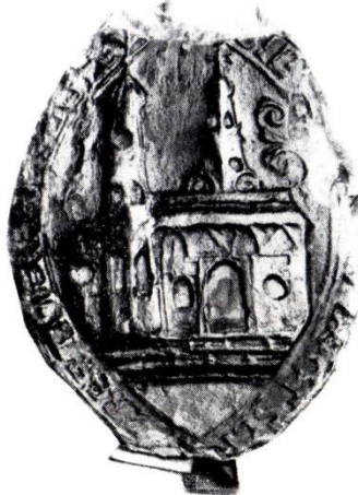
c. 1190. Hereford Cathedral. 3\frac{1}{4} \times 2\frac{1}{2} in. A.233