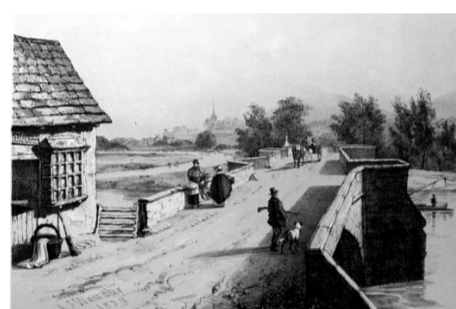
Wilton Bridge by Waudby 1839