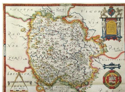
1577 Herefordshire county map by Christopher Saxton