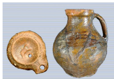
Romano-British lamp and a medieval jug found at the old Crystal Rooms in Hereford