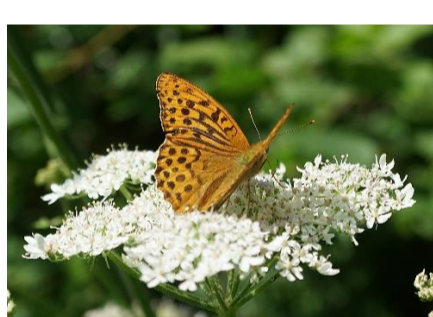
Silver-washed fritillary on hogweed