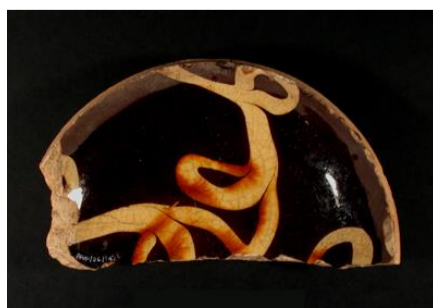
Post-medieval slip-coated pottery