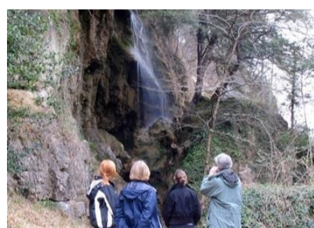
The Dripping Well on the Great Doward