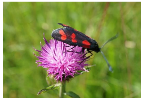
Six-spot burnet moth on knapweed