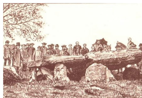
Woolhope Club Field Meeting to Arthur's Stone 25 May 1882 TWNFC pp. 164-9