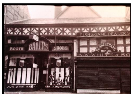
Hereford, no. 9 Eign Street when the RCHME surveyors visited in 1930