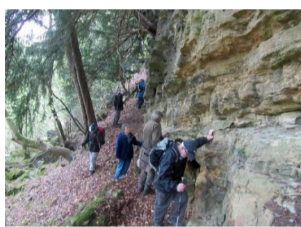
2018 Geology Field Meeting to Huntsham