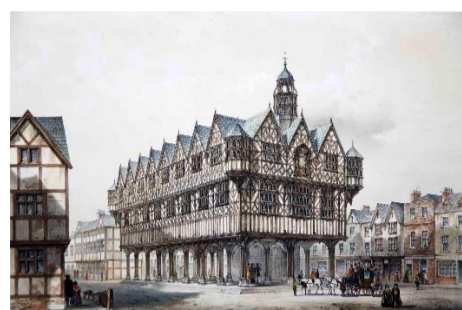
Hereford Market Hall in High Town before its demolition in 1861