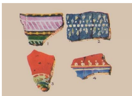
Kenchester (Magnis) painted wall plaster TWNFC 1912-3 Plate 29