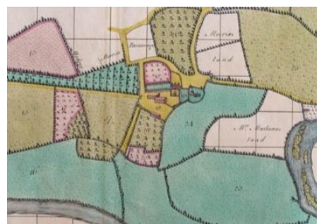
1771 Monnington Court estate map, Woolhope Club library.