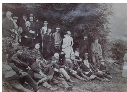
A Woolhope Club Field Meeting in 1884 to Bach Tump and Berrington from an album in the Club library